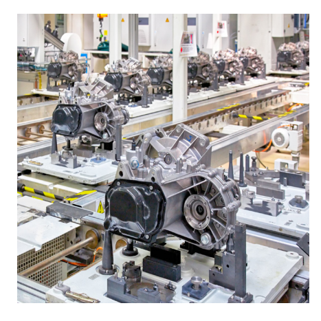
AUTO PARTS MFG | CRITICAL