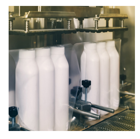
JUVENILE PRODUCTS MFG